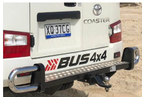
LATEST SAFETY FEATURES & TECHNOLOGY

The Bus 4x4 Full Time AWD Conversion Kit with High and Low Range 4x4 to suit Toyota Coaster (50 and 70 Series) comes standard with a 210mm lift and modified Front and Rear Suspension