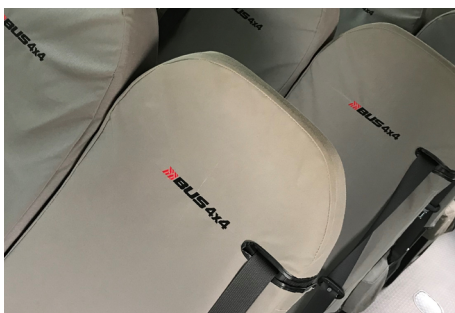
CUSTOM SEAT OPTIONS