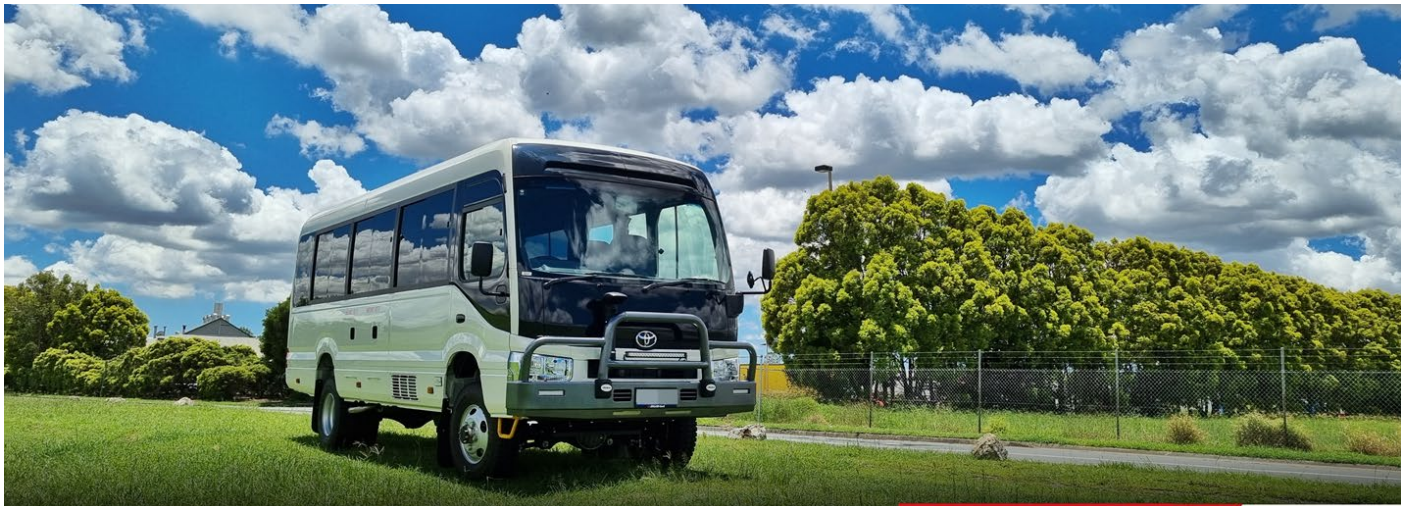
Pictured: Bus 4x4 Conversion of Toyota Coaster