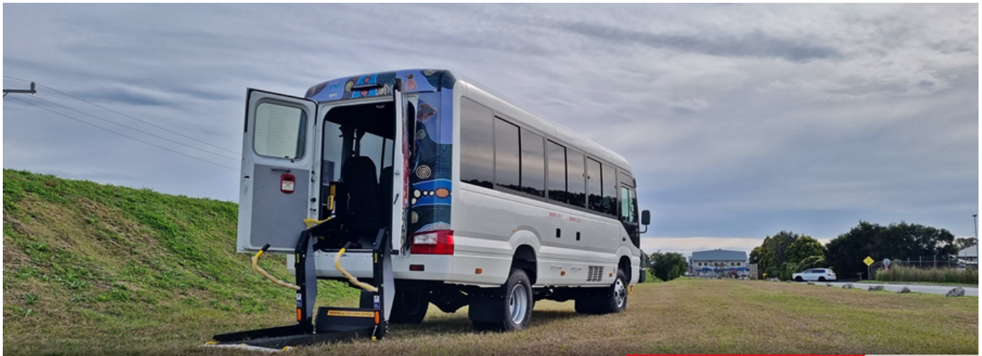
Pictured: Bus 4x4 Conversion of Coaster with Rear Wheelchair Lift