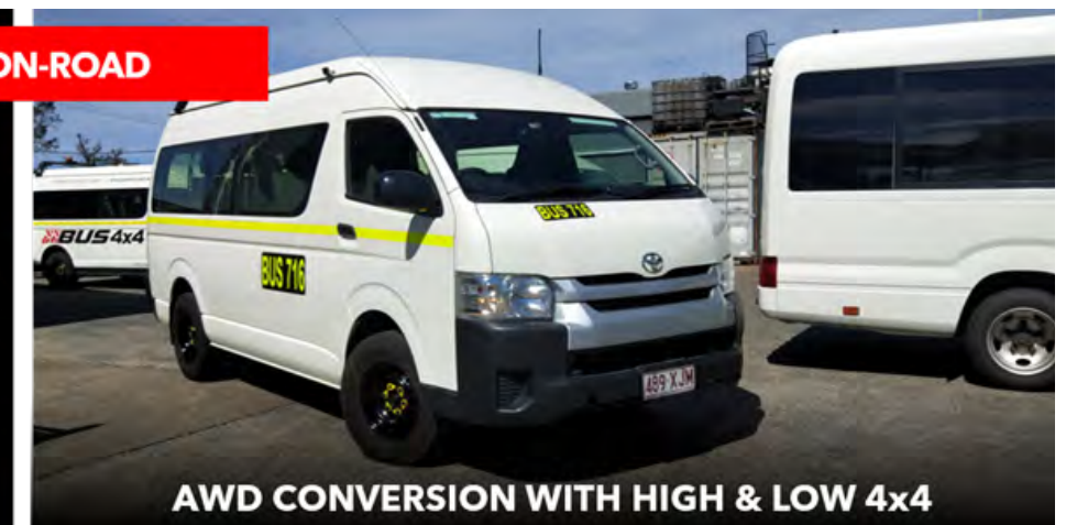
AWD CONVERSION WITH HIGH & LOW 4x4