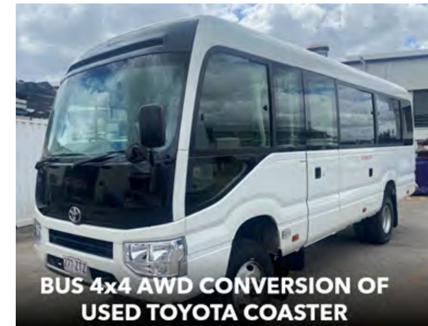
BUS 4x4 AWD CONVERSION OF USED TOYOTA COASTER