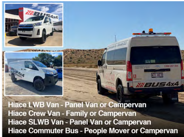
Hiace LWB Van - Panel Van or Campervan Hiace Crew Van - Family or Campervan Hiace SLWB Van - Panel Van or Campervan Hiace Commuter Bus - People Mover or Campervan

For more details on our Hiace Conversion Kits, call 07 3276 1420 email enquiries@bus4x4.com.au