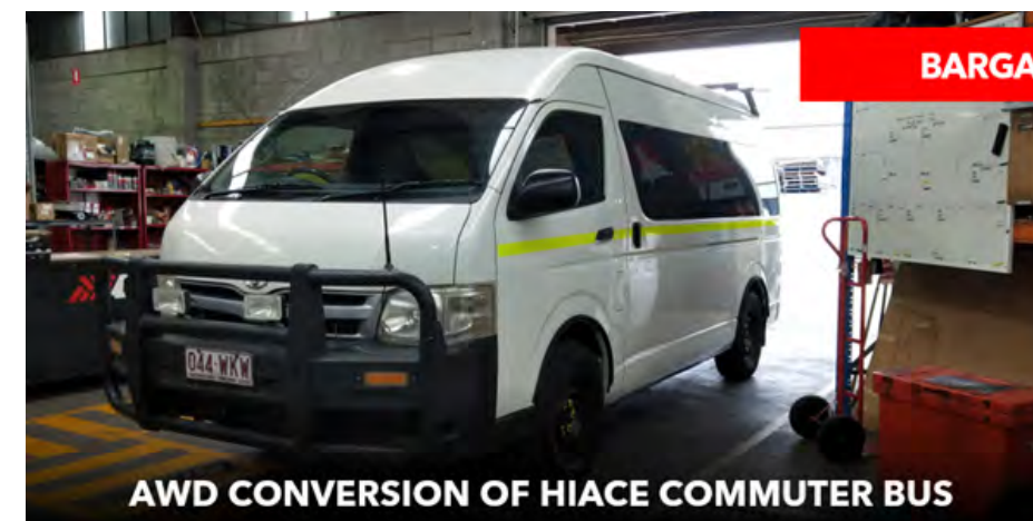
AWD CONVERSION OF HIACE COMMUTER BUS