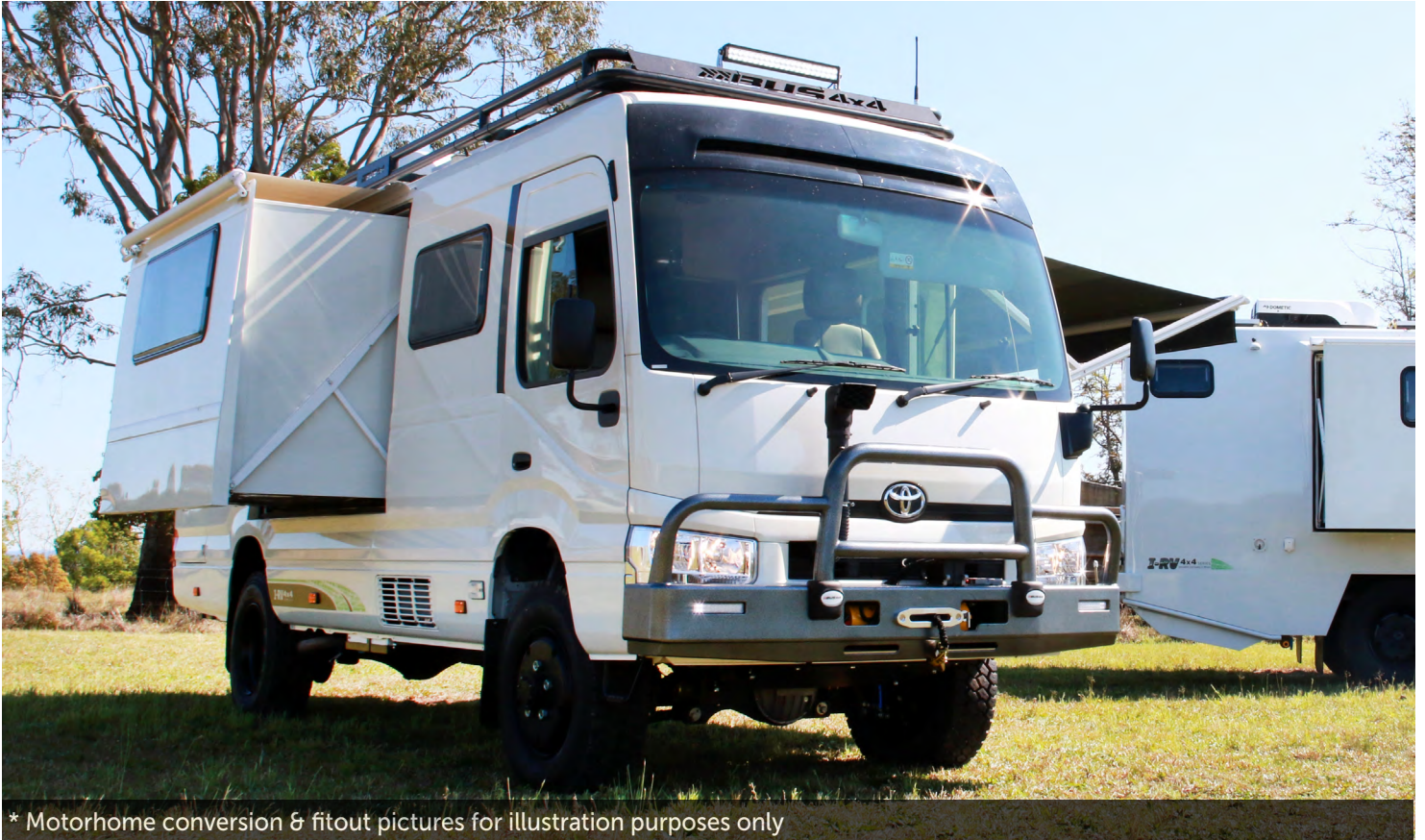
* Motorhome conversion & fitout pictures for illustration purposes only